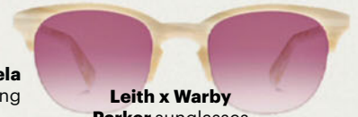
Leith x Warby Parker sunglasses