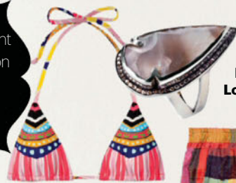
Pamela Love ring