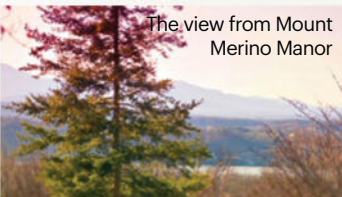
The view from Mount Merino Manor