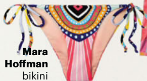
Mara Hoffman bikini