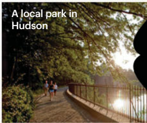
A local park in Hudson