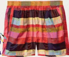
Ace & Jig shorts