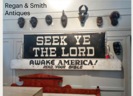
Regan & Smith Antiques

I carry SkinCeuticals eye cream with me everywhere—it's just the best. And I can't go anywhere without my Ren exfoliating face scrub.